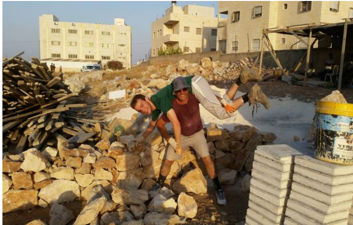
Joined by Go Palestine kids, a summer program for young people of Palestinian origin living abroad